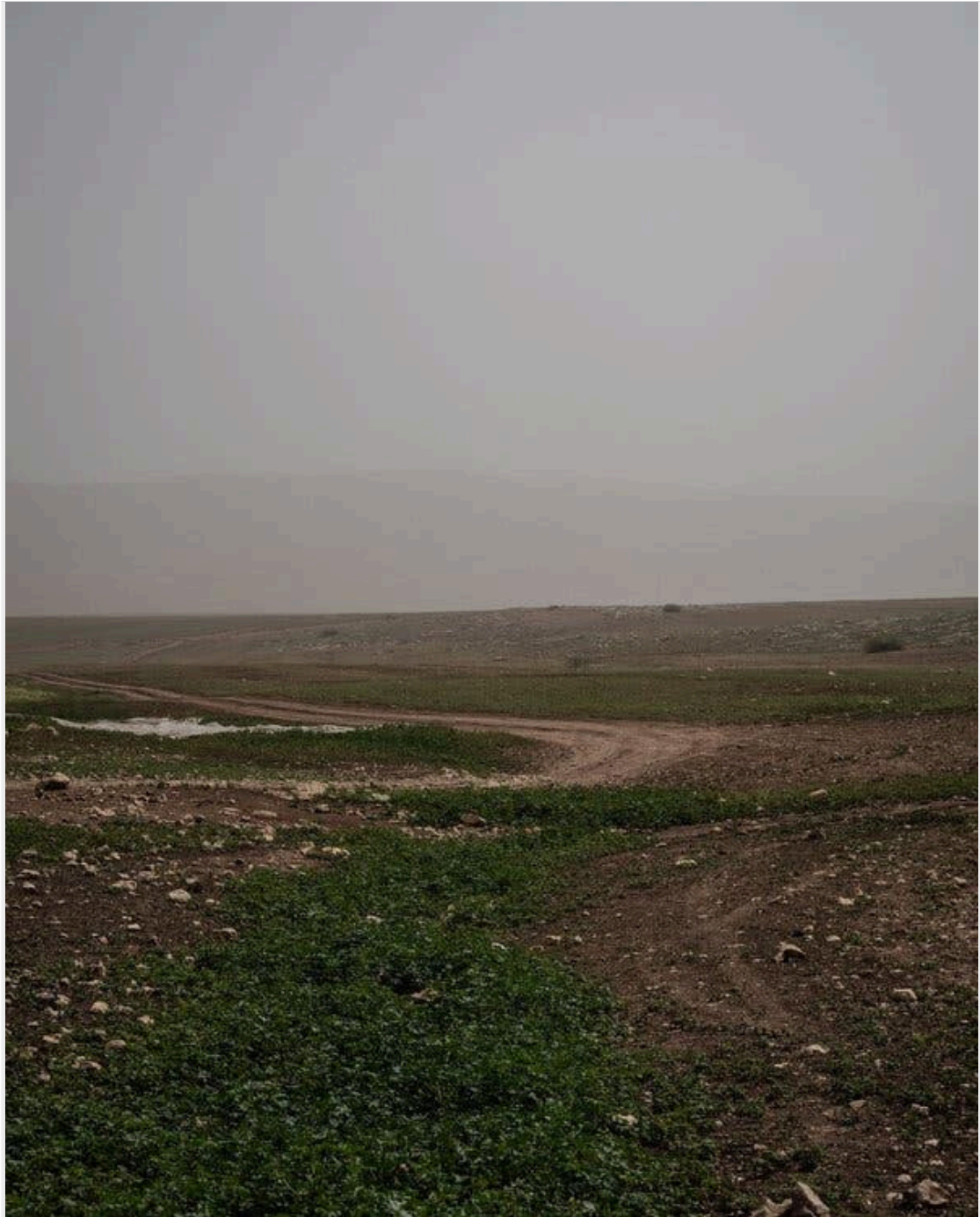
The Jordan Valley in the West Bank.

Itamar Ben-Gvir, Israel's national security minister, called detainees "scum" and "Nazis" and boasted of making prison conditions harsher for Palestinians. When such attitudes prevail, sexual abuse can become one more tool to inflict pain and humiliation on Palestinians.