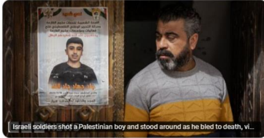
Israeli soldiers shot a Palestinian boy and stood around as he bled to death, vi...

Israeli soldiers shot a Palestinian boy and stood around as he bled to death, video shows